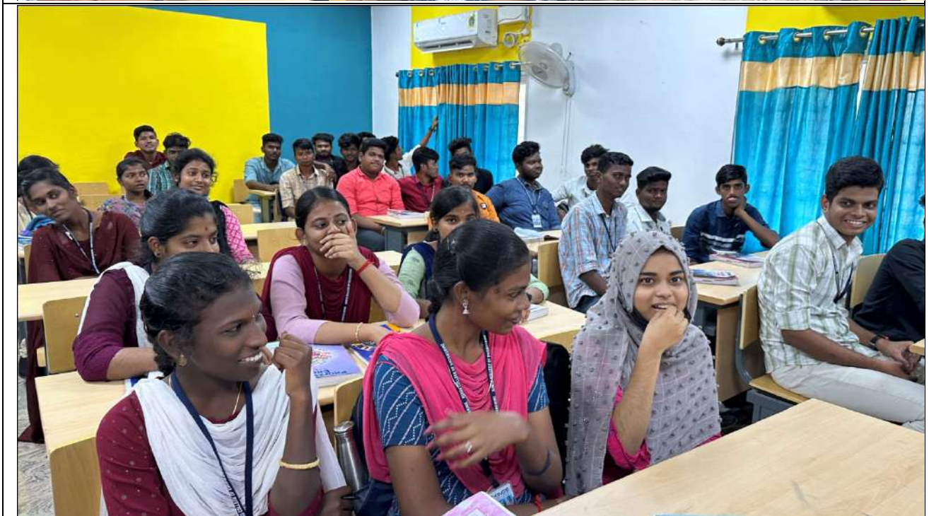
The students while swallowing albendazole tablets.